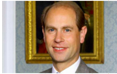
HRH the Earl of Wessex KG GCVO