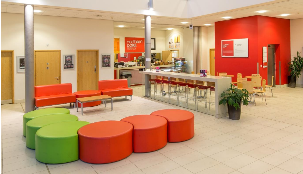
Northern Ballet's foyer seating with Cafe Bar in background

There are six round wooden tables each set with 4 wooden and chrome chairs. The tables have 735mm / 29 inches of clear access underneath. There is also a long high bar with 1100mm / 43.25 inches of clear access underneath and 8 high stools. This can be busy before performances in the Stanley & Audrey Burton Theatre. There is also an area to the front of the reception that has soft low furniture available to both café customers and general visitors.