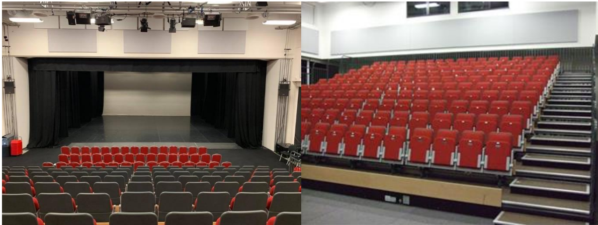
Stanley & Audrey Burton Theatre stage (left) and seating (right)

There is space available to store a mobility chair or wheelchair during performances at the theatre. Please let a steward know and they will store mobility chairs or wheelchairs at the back of the auditorium.