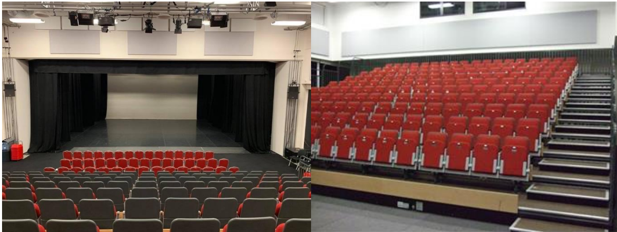
Stanley & Audrey Burton Theatre stage (left) and seating (right)

There is space available to store a mobility chair or wheelchair during performances at the theatre. Please let a steward know and they will store mobility chairs or wheelchairs at the back of the auditorium.