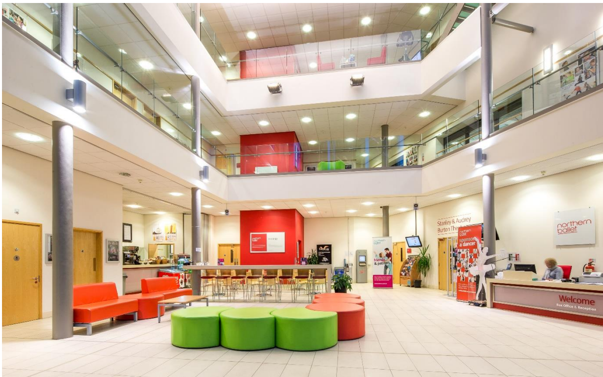
Northern Ballet Foyer

The main foyer is the heart of the building and contains the lift and stair access to all other floors, the reception desk and box office, the café bar and a seating area. Guide dogs are welcome, and water can be provided from the café.