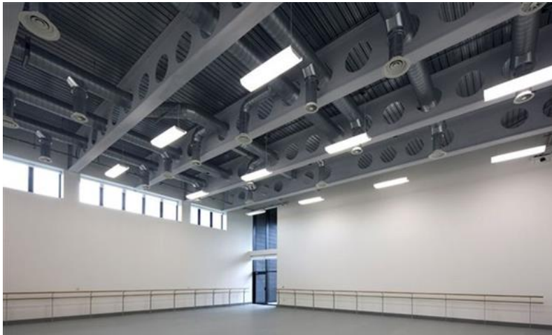
An example of a studio at Northern Ballet

The studios are all harlequin dance floor sealed from wall to wall. Many studios have permanent bench seating along one wall and moveable wooden stools. During conferences and non-dance events, the floors are tiled over with short-pile carpet.